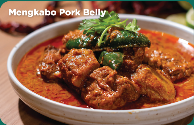
Mengkabo Pork Belly